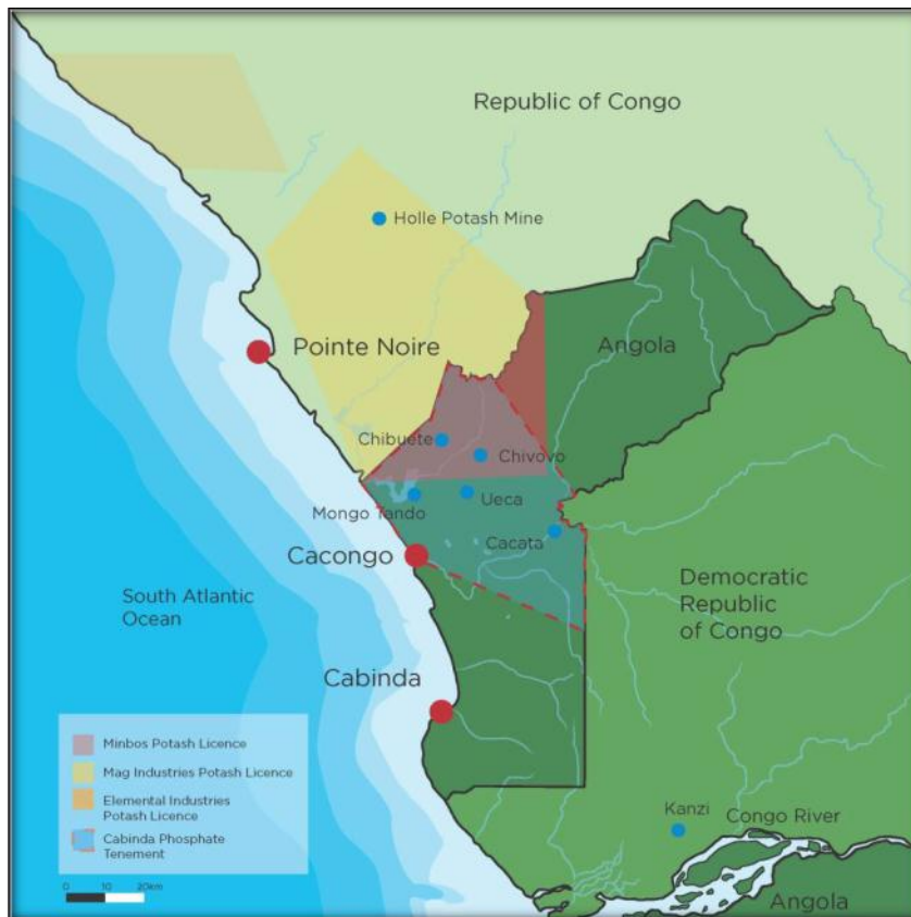
Figure 2 – Location of the Dingo Potash Licence

SOUTH AFRICA OFFICE 42 Kyalami Boulevard Kyalami Business Park, Kyalami Johannesburg South Africa T: +27 11 466 8516/7